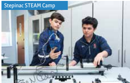
Stepinac STEAM Camp

Stepinac High School in White Plains runs several different camps each summer including a STEAM Camp (Science, Technology, Engineering, Art, Mathematics) and TACHS prep, in which campers will be exposed to robotics, engineering, video game design, Scratch animation, art and digital design, 3D printing, computer programming, Math, gaming, Physics and mechanics, and much more. The program includes field trips, recreational sports, and non-sports activities. Stepinac's Sports Camps include Baseball, Basketball, Football, Youth Non-Contact Football, and Soccer options.