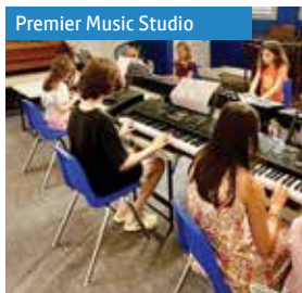
Premier Music Studio

If your child's interest leans towards the arts, is ages 4-8, but is not interested in or ready for a full-day camp, Premier Music Studio will be offering a Mini Camp each weekday from June 26-August 25 from 1:00-3:15 p.m. that will concentrate on music, dance, and arts. One parent said, "Our four-year-old daughter has been taking group piano lessons at Premier and lesson days are her favorite days! I wasn't sure what to expect at such a young age, but she is advancing at a joyous rate, thrilling herself and us. Attending music and arts camp and being able to go to Premier multiple days in a row is her dream come true!"