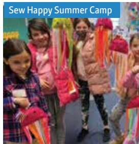
Sew Happy Summer Camp

Sew Happy Studios in Mamaroneck has been teaching kids the life skill of sewing since 2011, and its camps include Fashion Design, Hand Sewing, Machine Sewing, and Me & My Doll. The camps are half-day and take place from 9:00 a.m. – 12:00 p.m. or 1:00 p.m. – 4:00 p.m., but anyone who attends both morning and afternoon camps may bring their lunch, and early drop-off is available.