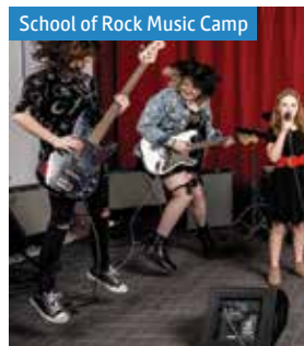
School of Rock Music Camp

School of Rock in Mamaroneck is proud to offer music camps to help teach eager young musicians how to play instruments with skill and confidence in a group setting. They teach everything from keyboard, vocals, guitar/bass guitar, drums, songwriting, vocals, and even ukulele for all levels. They offer 3-4 day music camps for children 5-7 and 5-day camps for ages 7-18. All camp sessions begin at 10am and end at 3pm.