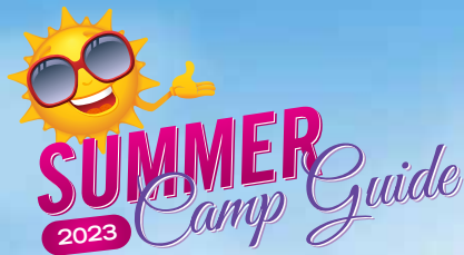
Songcatchers Choir Camp