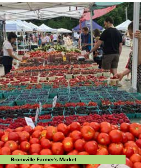
Bronxville Farmer's Market