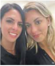
By Dominique & Maxine, LaGravinese Jewelers of Pelham

When lab-grown diamonds first became popular most people were very skeptical. Is it a real diamond? Can anybody tell them apart? What is their real value? What is your opinion on them? These are just a few of the questions that we were frequently asked.